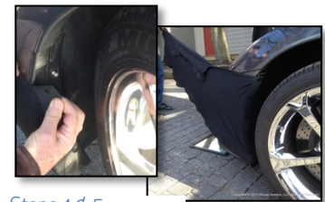
Steps 4 & 5

Open the hood. Hold the top of the mask and pull it up to the hood opening. Secure the top corners of the mask to the body frame just inside the hood opening. Remove the screws on the frame that best align with the snaps on the mask and replace with a snap head screw stud. Secure the mask by fastening the snaps on the mask to the snaps just installed.