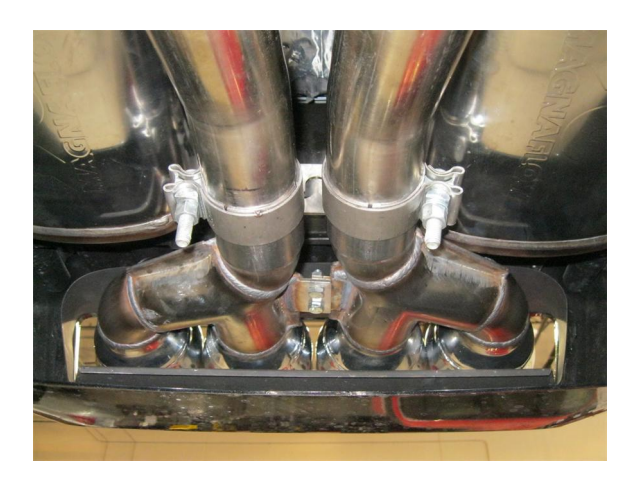
Step 6. Once a final position has been chosen for the new exhaust system, evenly tighten all clamps from front to rear using the torque specifications on page one of the instructions. Inspect all fasteners after 25-50 miles of operation and re-tighten if necessary.