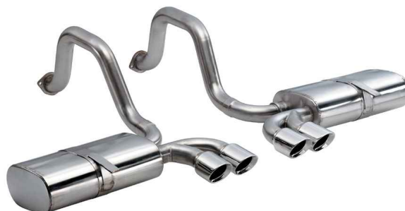
Pro-Series 3.5 Tips