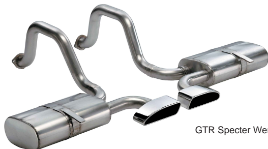
GTR Specter Werkes Tips