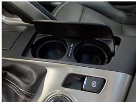
PHOTO 1 – THE STOP FLOP CUP HOLDER MOUNTS INTO THE FACTORY CONSOLE TRAY WITH SUPPLIED SELF-ADHESIVE TAPE.